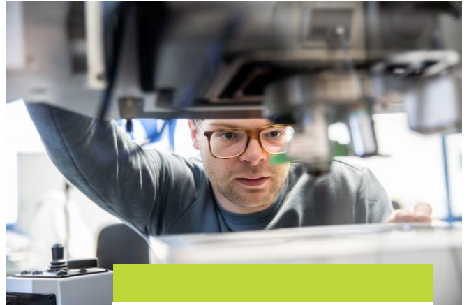
EUROTECH UNIVERSITIES ALLIANCE

Here you can also find a promotional video and information videos about the programme, and testimonials from participants of the first programme.